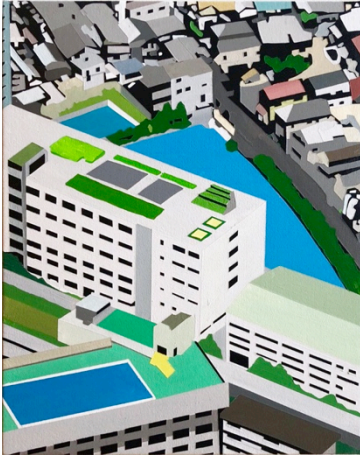
Brian Alfred Sky Tree View Acrylic on canvas 2018 16 x 20 in