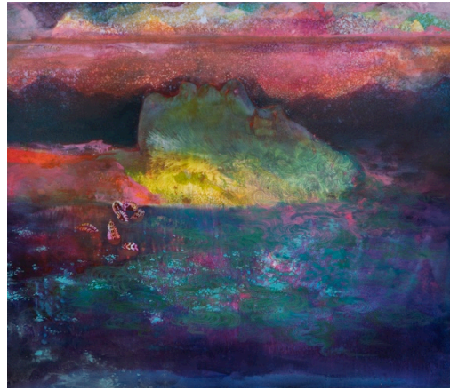
Firelei Báez TBC (floating woman) Acrylic on canvas 2019 43 x 45.5 in