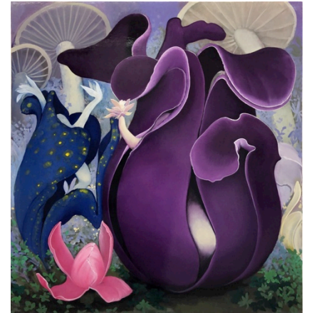
Inka Essenhigh TBC Enamel on canvas 2019 32 x 24 in