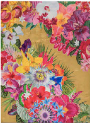
Carlos Rolón Gild the Lily (Caribbean Hybrid II) Oil, ink, and 24kt gold leaf on linen 2018 72 x 54 in