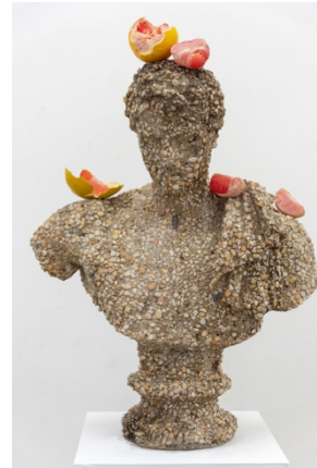
Tony Matelli Bust Concrete, painted bronze, painted urethane 2019 36 x 24 x 17 in