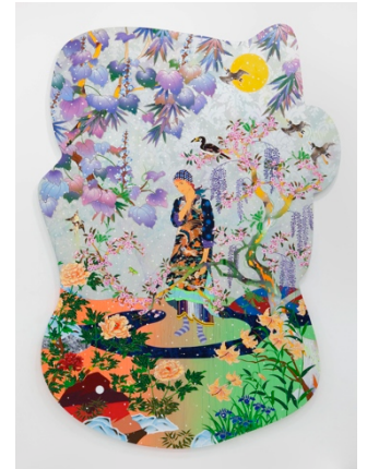
Tomokazu Matsuyama Swell Being Yourself Acrylic and mixed media on canvas 2019 103 x 73 x 1.5 in